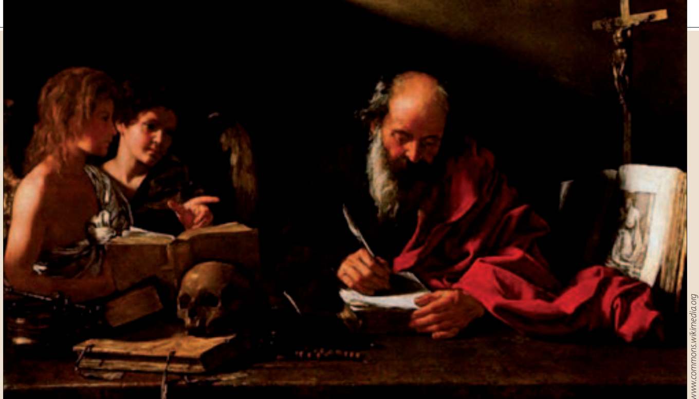
■ St Jerome visited by angels by Bartolomeo Cavarozzi, early 17th c.

his etymological research frequently provided pertinent insights.