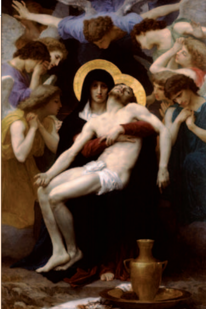
■ Pieta by William-Adolphe Bouguereau, 1876.

Mary, then, is the one who has the deepest knowledge of the mystery of God’s mercy. She knows its price, she knows how great it is. In this sense, we call her the Mother of mercy: our Lady of mercy, or Mother of divine mercy; in each one of these titles there is a deep theological meaning, for they express the special preparation of her soul, of her whole personality, so that