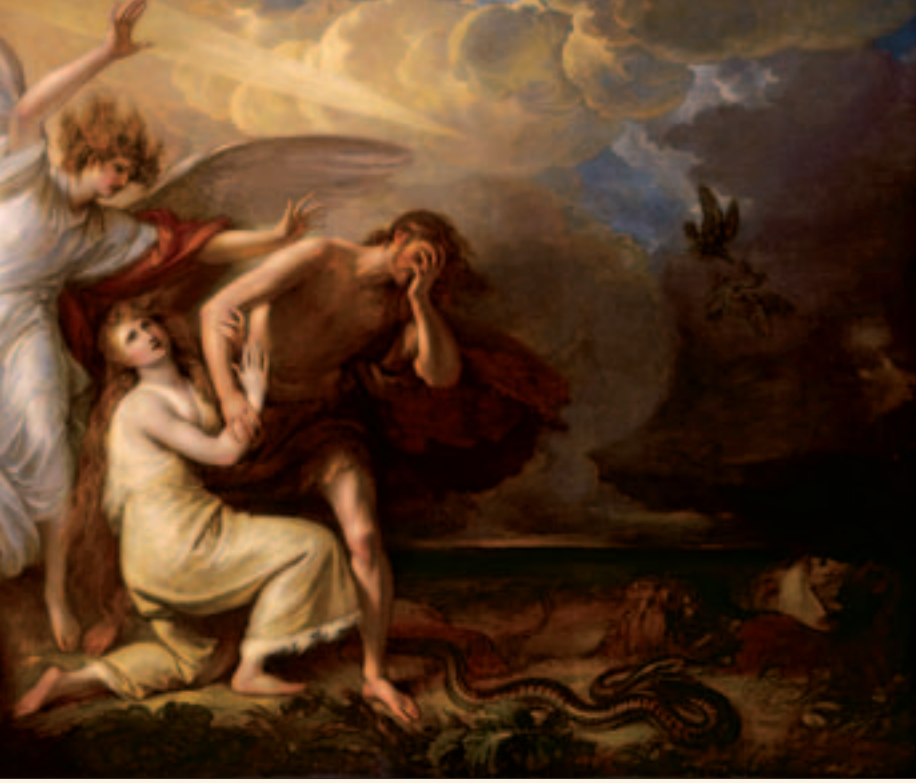
■ The Expulsion of Adam and Eve from Paradise by Benjamin West, 1791.

Ganges (which he considered to be part of the Nile) and the river Pishon with the Indus.