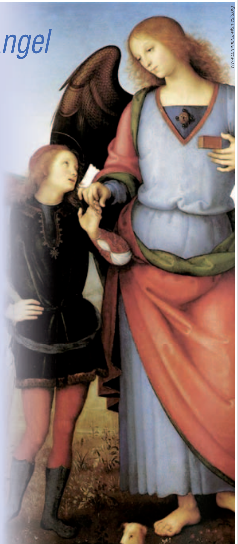
■ Archangel Raphael with Tobias by Pietro Perugino, c. 1500